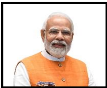
Shri Narendra Modi Hon'ble Prime Minister India