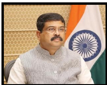
Mr. Dharmendra Pradhan Minister of Education and Skill Development and Entrepreneurship, India